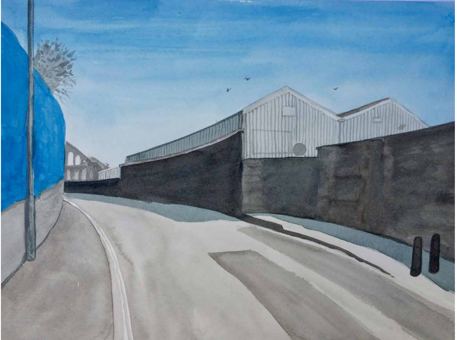
Approach 31 x 23 cm