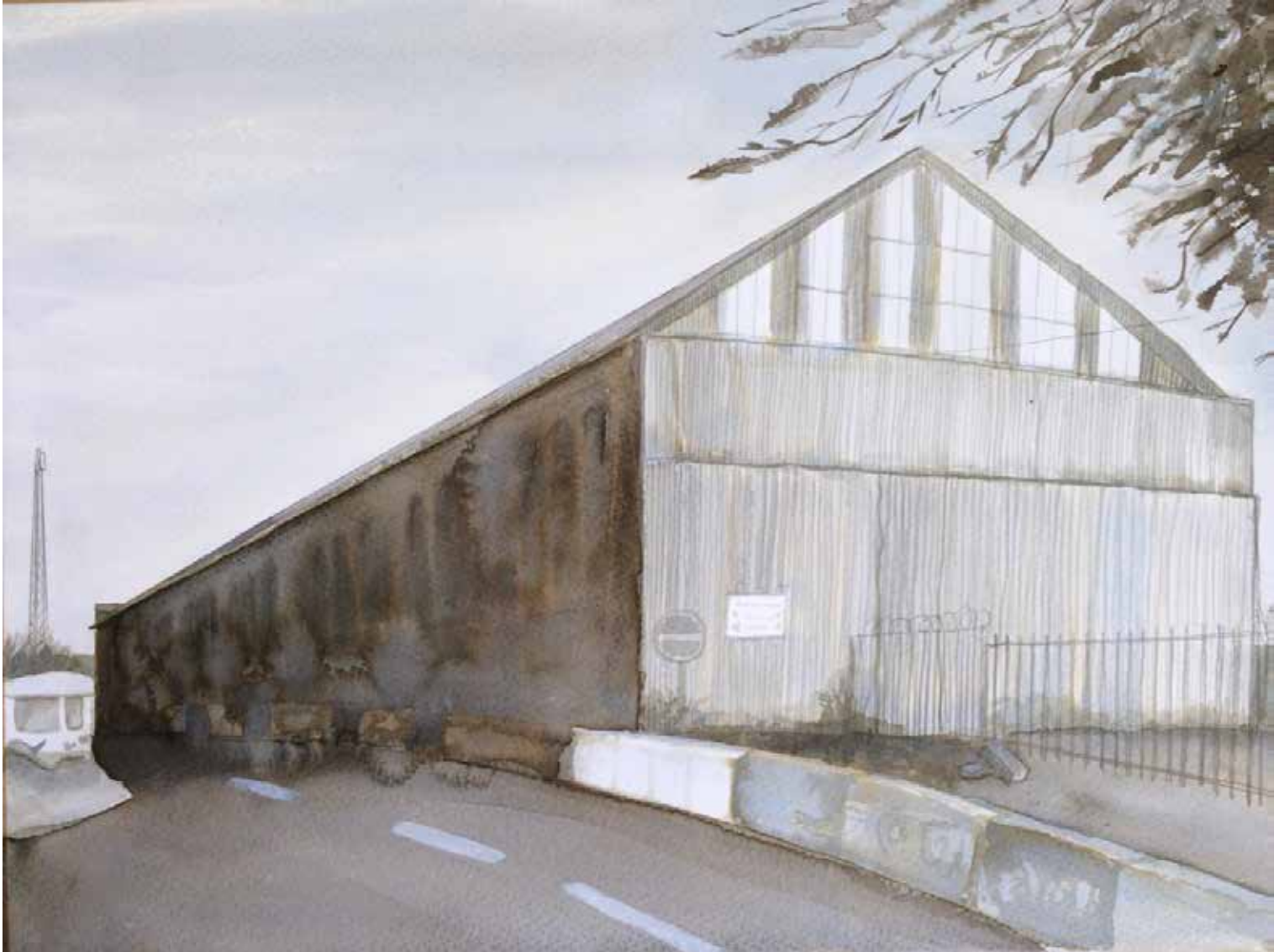
Gable End 39.5 x 27.5 cm