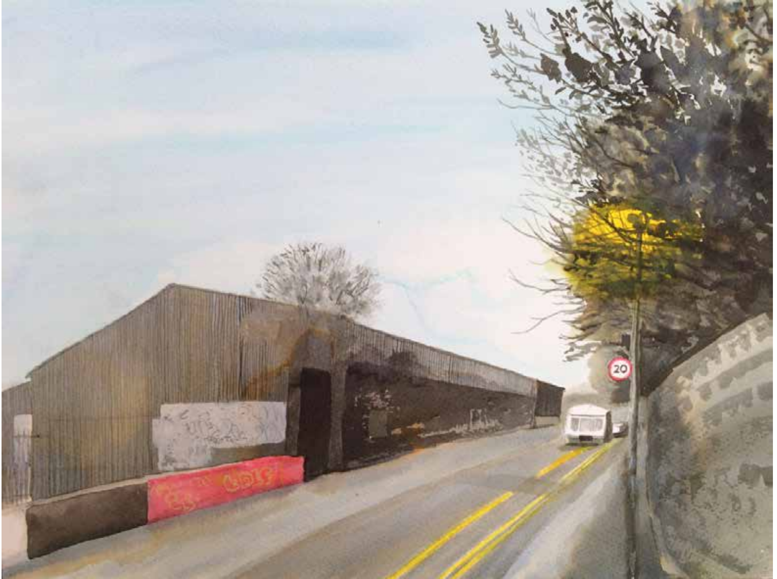
Dawn 39.5 x 27.5 cm