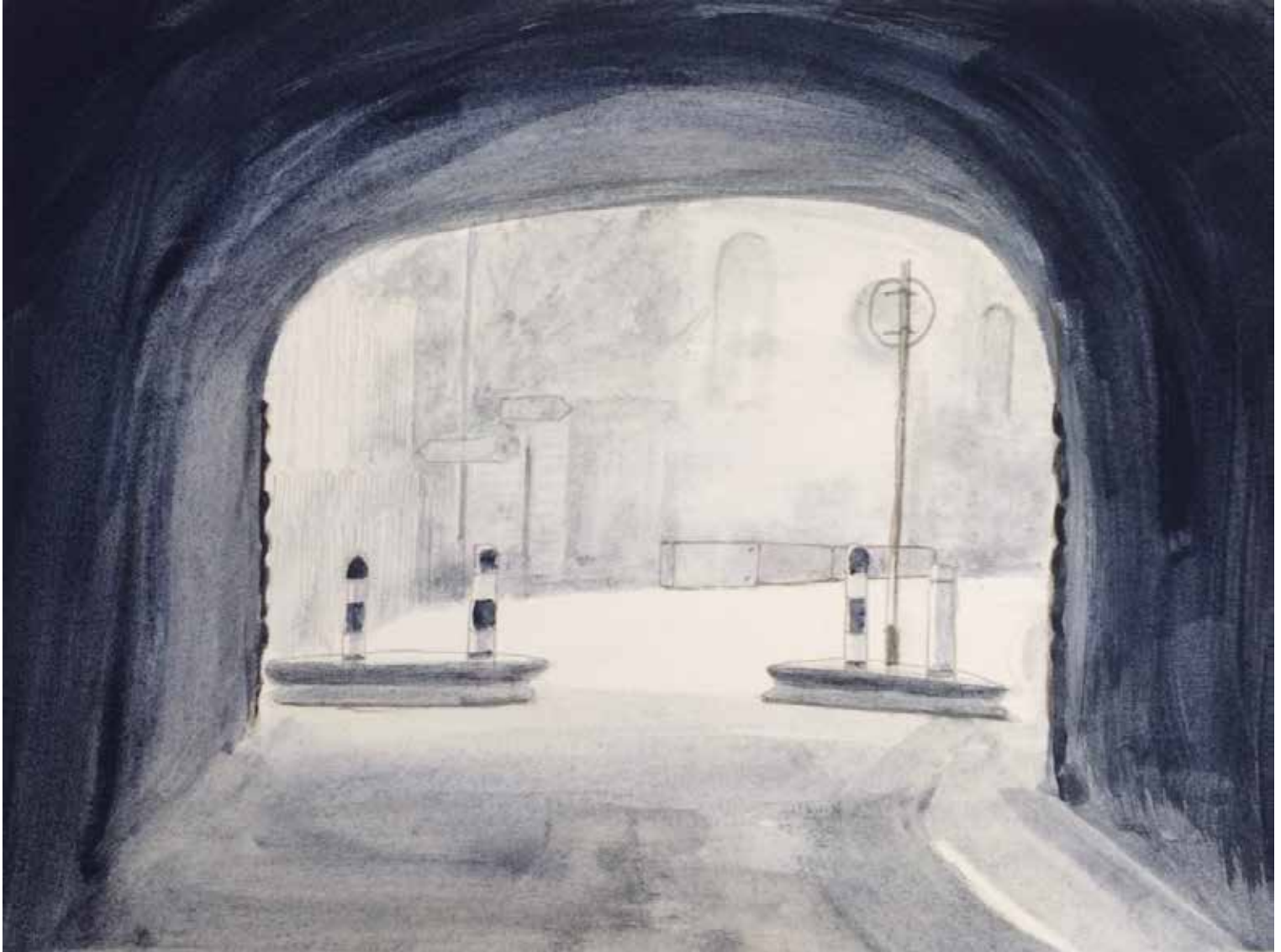
End of the road